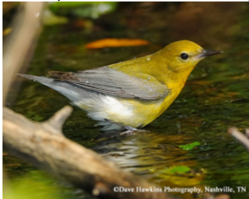
Female prothonotary Warbler

A small songbird with a deep golden yellow head and chest, a bright black eye, solid gray wings, and white belly and undertail. The female is slightly duller than the male.